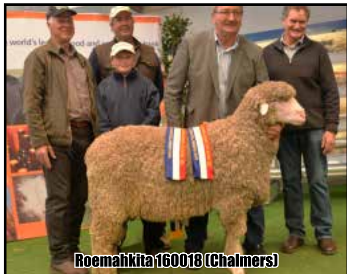
Roemahkita 160018 (Chalmers)