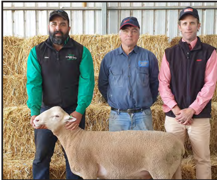
Top priced White Suffolk ram - 190178 - was purchased by the Karulga stud from Ungarra for $3,000.