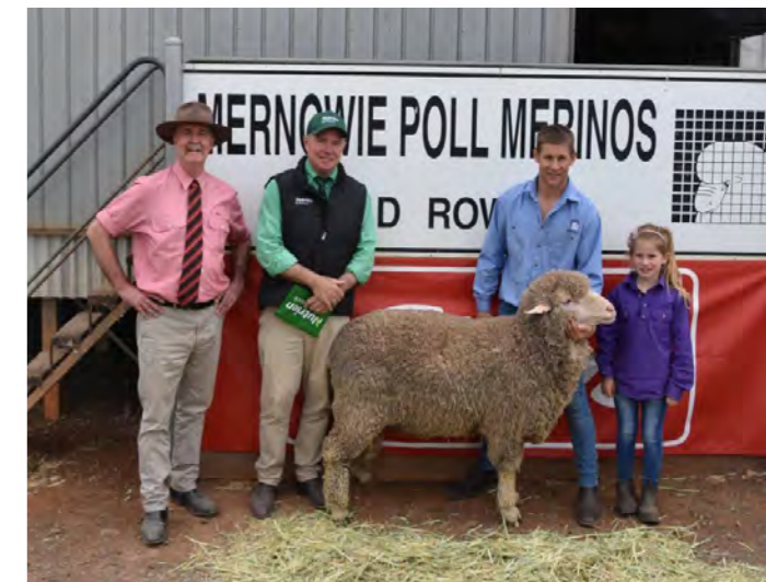
Mernowie Poll Merino - Tag 190019

YANTA on property sale Wednesday 25th August