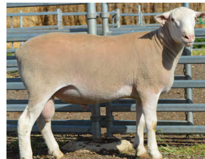
Ashmore White Suffolk - Tag 190218